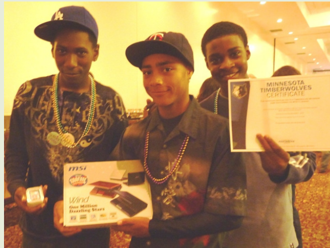
(Conner brothers raffle winners of iPod, Laptop and Timberwolves Suite)

The celebratory event heightened the need for families for children under state guardianship who are available for adoption. Many who attended and who volunteered were prospective parents who picked up information materials and asked thought-provoking questions of workers who were in attendance.