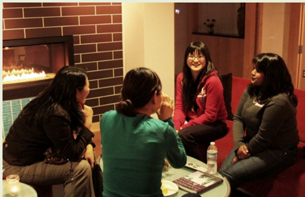
(Local adoptees gather for the Meet-Up at The Lyric)